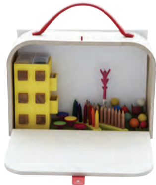
Colouring suitcase created by Hina Thibaud enabling children to rebuild their world through utilitarian items and feel more comfortable in an unfamiliar place.